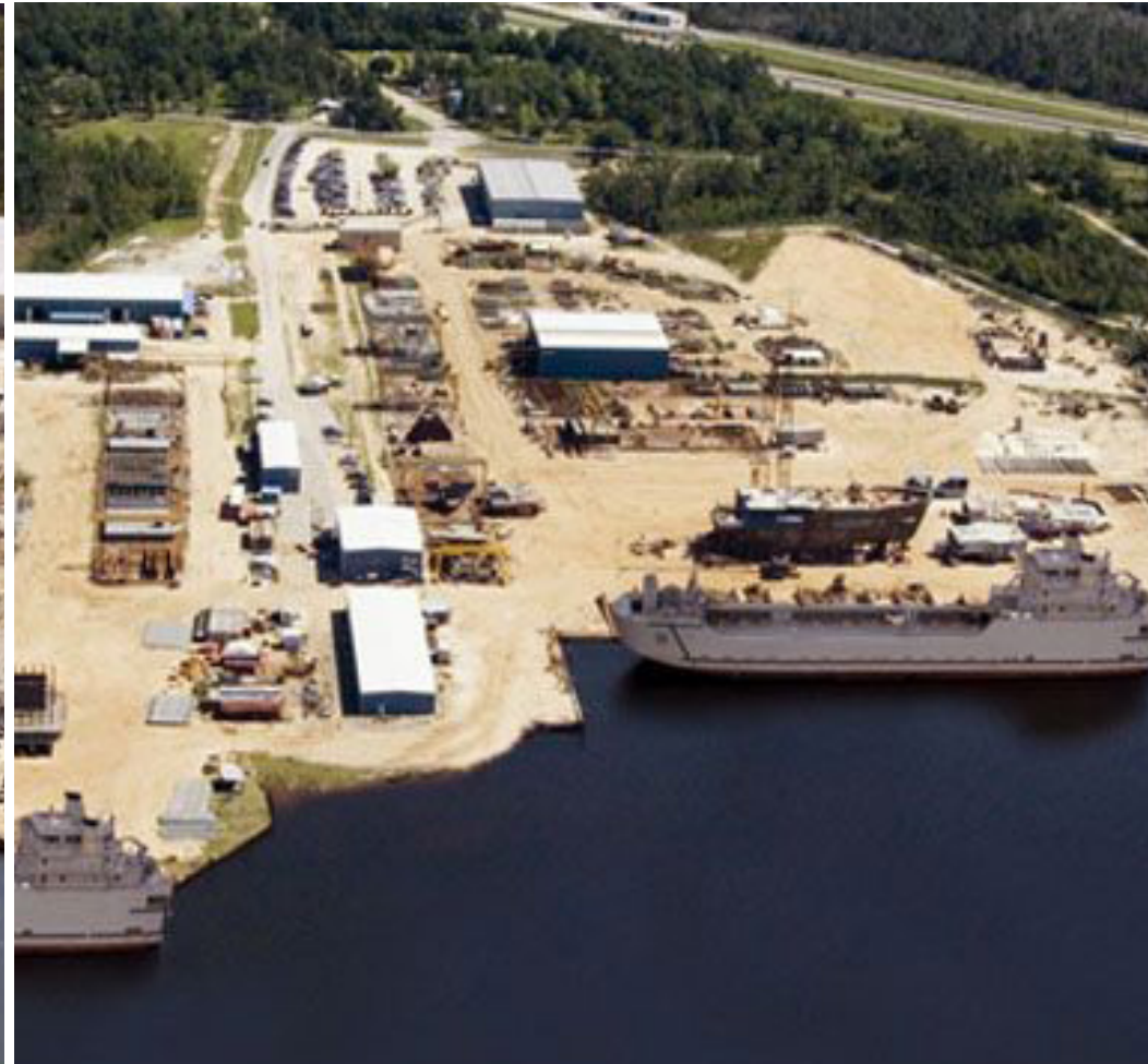
5801 ELDER FERRY RD MOSS POINT, MS 39563