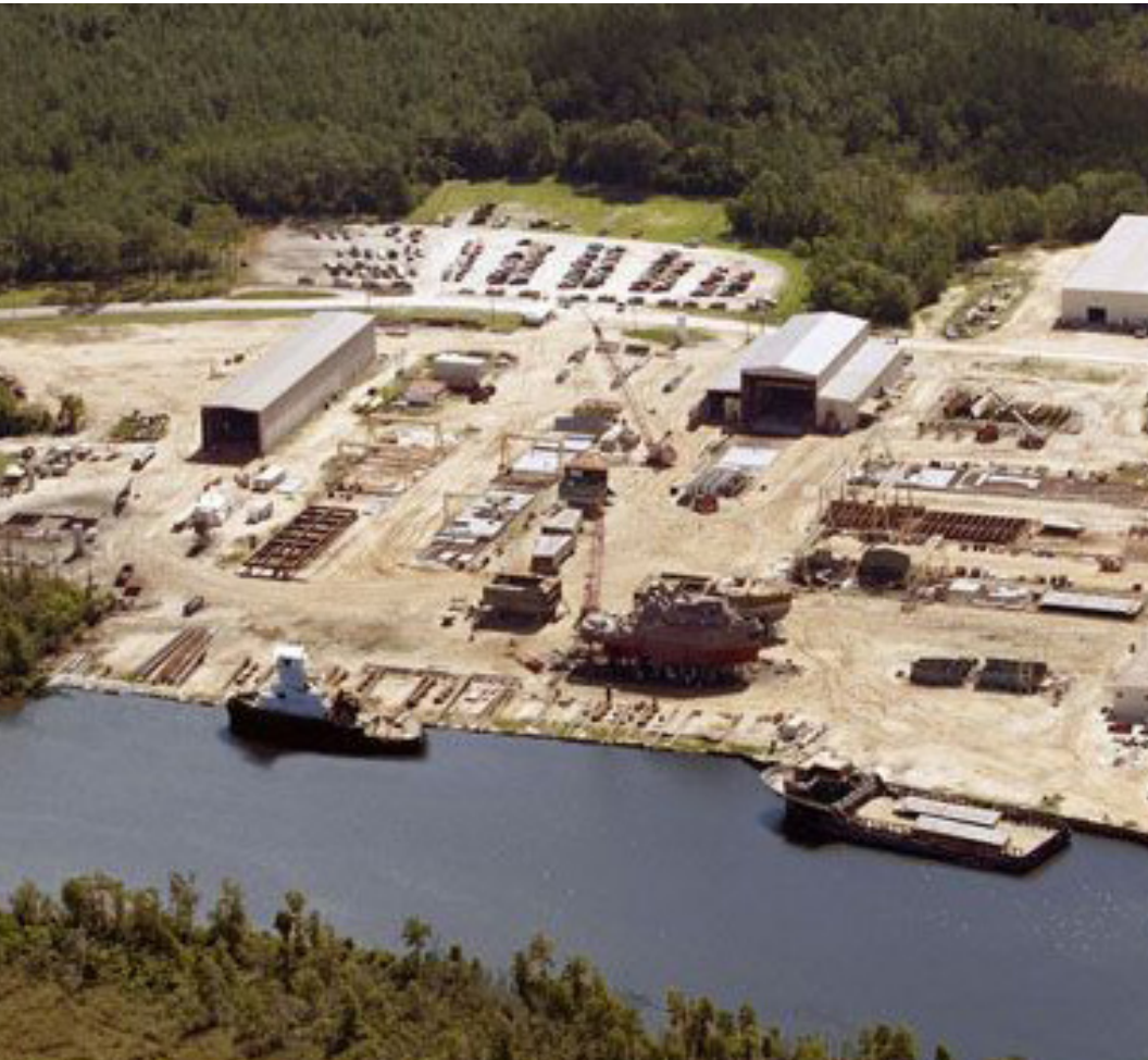
7801 TRINITY DR MOSS POINT, MS 39562

MISSISSIPPI GULF COAST INDUSTRIAL PROPERTIES JACKSON COUNTY, MS